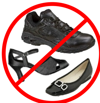
NO tennis/athletic shoes Must completely enclose foot NO buckles or embellishments