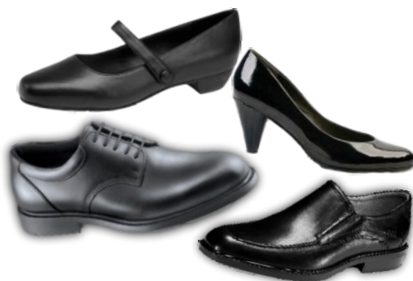
Flats, heels, black straps ok