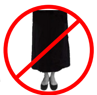
Doesn't touch foot (too short)