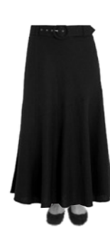
This length or longer ok