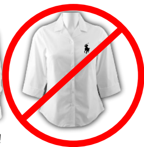
Sleeves too short NO embellishments