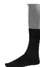
MUST be mid-calf or higher NO ankle socks