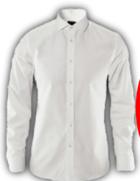
Perfect length! Proper collar & is button-down

More detailed information about Concert Dress can be found on our website and in your child's music folder.