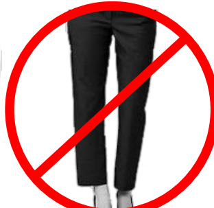
Doesn't touch foot (too short)